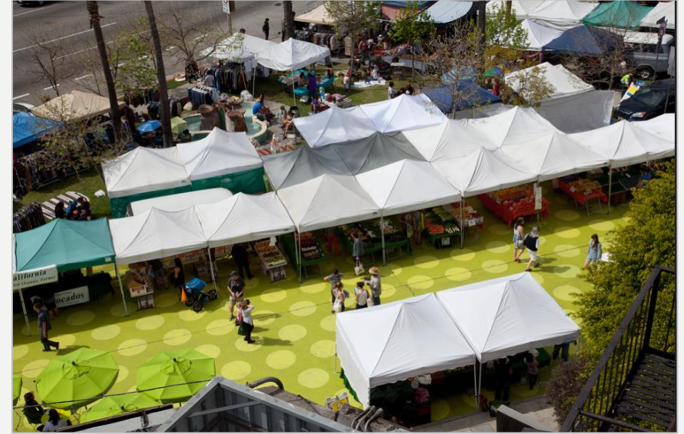
Sunset Triangle Plaza | Los Angeles, CA