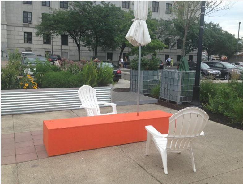
Moveable seating and chairs