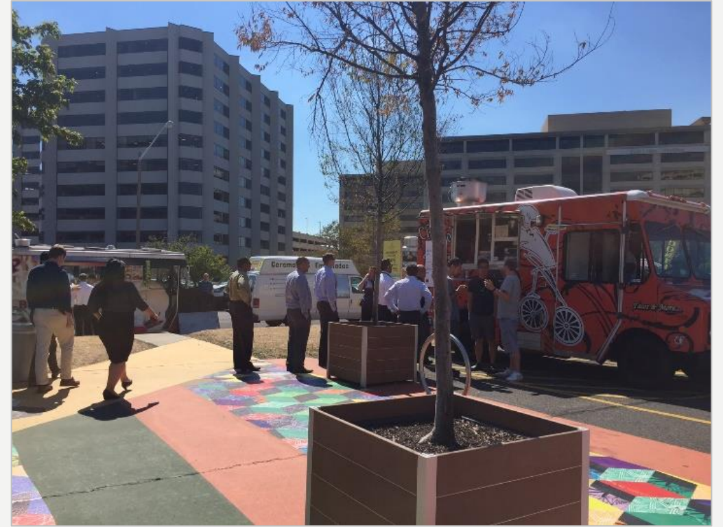
Greensboro Green at The Boro | Tysons, VA